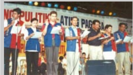
For good governance : PPC Candidates took their oath to institute the program of good governance and to serve the people once elected in office