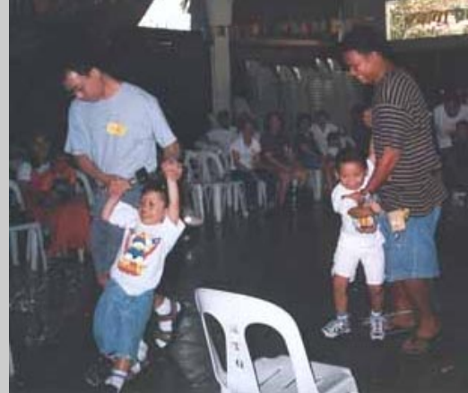
Parents must involve themselves...to get their kids involved as well