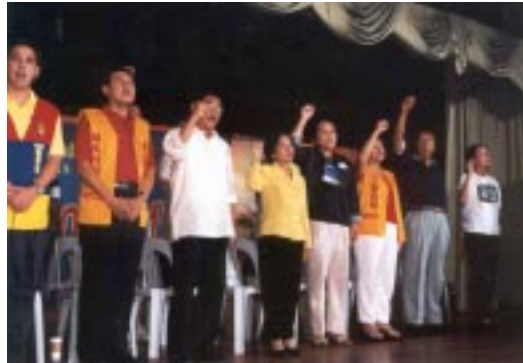
Gloria Macapagal-Arroyo at 13-0 Movement launching in La Salle Greenhills

There are many other believers in the 13-0 movement. As of this writing, 54 organizations and cause-oriented groups