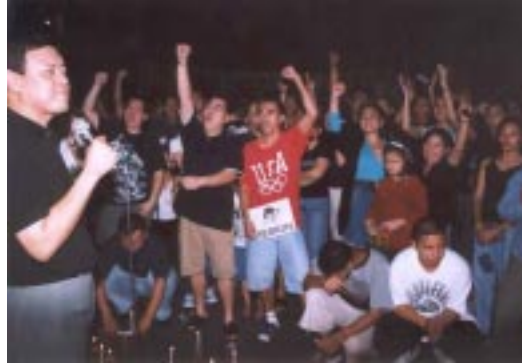
YFC members cheering former House Speaker Manny Villar

can be done. It would take a lot of political will and spiritual strength but it can be done.”