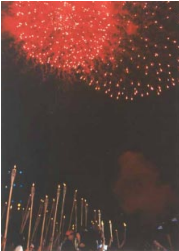
Fireworks lit the sky during the Laya Street Party in EDSA