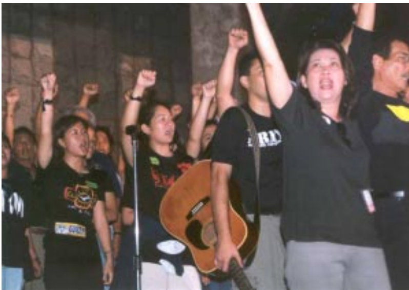
With fervent idealism shown on their faces, these youth sang EDSA 2's most famous song - "Bayan Ko"

In like manner, we as CFC cannot be for the Senatorial candidates of the Pwersa ng Masa , the ousted President's ticket. Why? For the simple reason that they are pro-Erap, and blindly loyal to his cause. If they find their way back to power, they would try to bring Estrada back, and again condone if not support his wrongdoing. They defend him, they justify his actions, they even praise him to high heavens. As such, they are as much a part of the moral corruption that has pervaded our government and society. We ousted Erap; we should not allow his minions to return or get into the Senate.