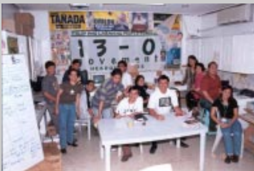
13-0 Movement Headquarters