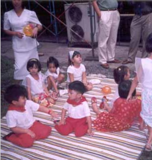
We relate well as children... if we are properly guided by adults