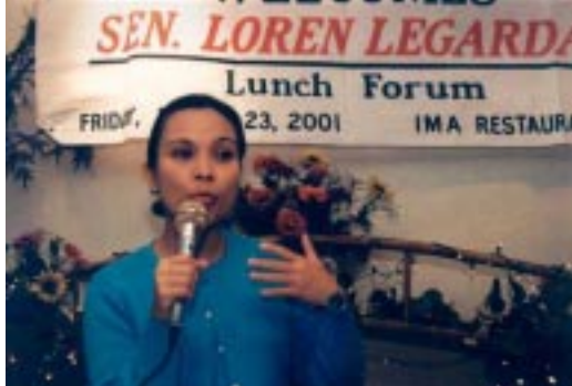
Sen. Loren Legarda

This is where being “ pakialamera ” [busybody]