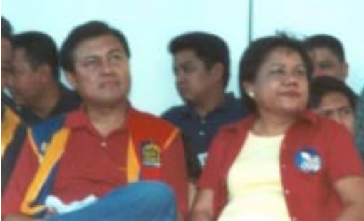
Manny Villar and his wife Cynthia

Now that the catchphrase of the day is “New Politics”, what does he think of it? “It is a politics of consultation; of listening – a politics free from graft and corruption; of being a good example; a politics of good governance. It means integrity, commitment and transparency in public service. It means innovative, non-traditional approaches to solving the country’s problems. Most importantly, it means departing from old practices of traditional politics that have not served the best interests of Filipinos.” Manny concurs with the view of many that this is difficult to achieve. But he says, “It