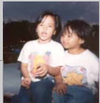
The children are our future. Teach them well and let them lead the way.